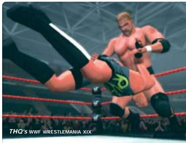
THQ'S WWF WRESTLEMANIA XIX