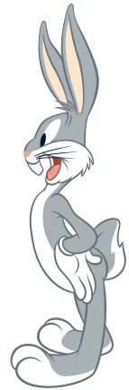
Electronic Arts/WB's LOONEY TUNES: BACK IN ACTION

New games debuting at the Electronic Entertainment Expo run the gamut from sports to spies, sci-fi, and SpongeBob.